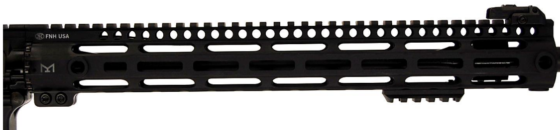
Midwest Industries SSM M-LOK™ 15” free-float forearm with M-LOK™ rail and front sight attached.

The Midwest Industries, Inc. SSM M-LOK™ 15” free-float forearm/rail assembly is installed on the FN15™ DMR in place of the standard round handguards. The SSM M-LOK™ rail assembly extends over a low profile gas block. It allows for mounting of additional grips, sights, laser devices and other accessories onto a rigid, free-float forearm. T-Slot markings on the top Mil-Std M-1913 rail allow for recording of accessory locations for reference. A polymer 5-slot M-LOK™ rail is included with your FN15™ DMR. Additional M-LOK™ mounting accessories and options are available directly from Magpul®. (www.magpul.com) Please refer to your individual accessory’s instructions for correct mounting.